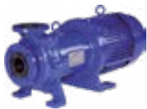
Magnetic Drive Large Chemical Process Pumps