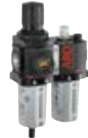
Piston Pump Accessories