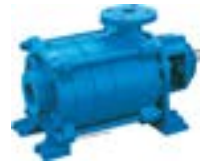
Multi-Stage Ring Section Pumps