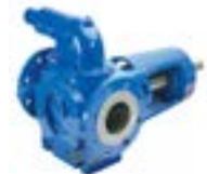
Internal Gear Pumps - Petro Chemical service