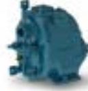
Self-Priming Wet Prime Pumps