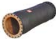
Heavy Duty Hose

TOWNLEY Engineering & Manufacturing Co., Inc.