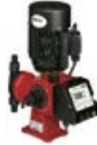
Hydraulically Actuated Diaphragm Dosing Pumps