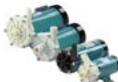
Magnetic Drive Fractional HP Pumps