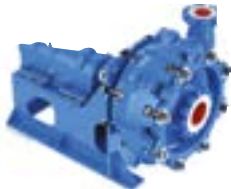
Slurry & Solids Handling Pumps