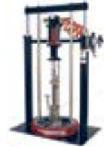
Piston Pumps & Packages