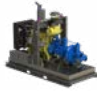
High Head HiMax Pumps