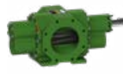
Bulk Liquid Handling Gear Pumps