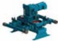
Double Diaphragm Pumps