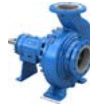
Heavy Duty Process Pumps