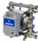
Electric Operated Double Diaphragm Pumps