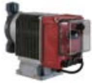
Solenoid Diaphragm Dosing Pumps