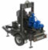
Contractor Low Head Pumps