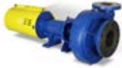
High Capacity End-Suction