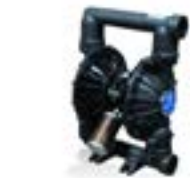
General Double Diaphragm Pumps