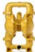
Large Air Operated Diaphragm Pumps