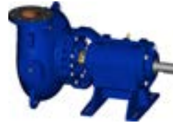
Food Transfer Pumps