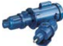
Small Progressing Cavity Pumps