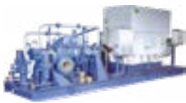
API Process Pumps