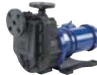
Magnetic Drive Self-Priming Pumps