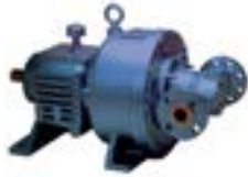
API 610 High Pressure Pumps