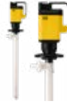
Motor Driven Piston Dosing Pumps