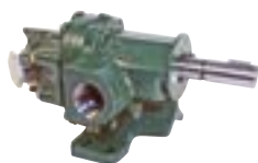
Small Gear Pumps