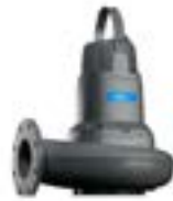
Clog Resistant Pumps