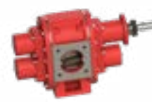
Abrasive Liquids Gear Pumps