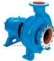
Paper Stock Pumps