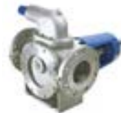
Stainless Steel Pumps - Corrosive Fluids