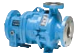
Magnetic Drive Pumps