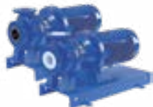
Magnetic Drive Medium Chemical Process Pumps