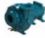
Self-Priming Dry Prime Pumps