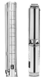
Hi/Lo Series Submersible Pumps

NOTE: Certain brands may not be available in all Canadian provinces.