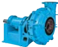
Severe Duty Slurry Pumps