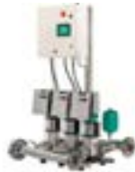
High-Efficiency Pressure Boosting Systems