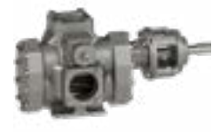
Stainless Steel Gear Pumps

NOTE: Certain brands may not be available in all Canadian provinces.