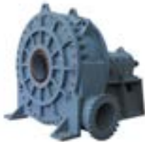
Slurry Pump Conversion Units