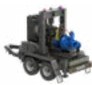
Medium Head Pumps