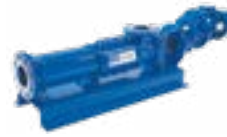
EZstrip™ Progressing Cavity Pumps