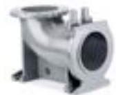
Discharge Connection and Guide System

TOWNLEY Engineering & Manufacturing Co., Inc.