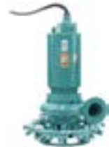
Submersible Slurry Pumps

VERSA-MATIC PUMPS Engineered to do more.