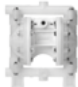
Medium Air Operated Diaphragm Pumps