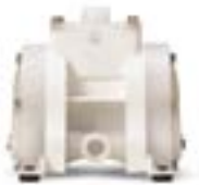
Small Air Operated Diaphragm Pumps

VERSA-MATIC PUMPS Engineered to do more.