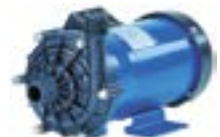
Magnetic Drive 1/2 to 5hp Pumps

NOTE: Certain brands may not be available in all Canadian provinces.