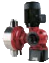
Motor Driven Diaphragm Dosing Pumps