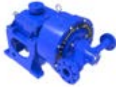
High Pressure Pumps