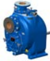
Self Priming Pumps