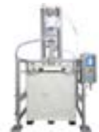
Bin & Drum Unloaders