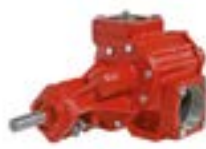
Process Gear Pumps