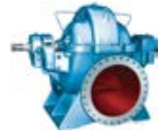
Split Case Pumps