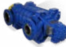
Multistage, Ring Section