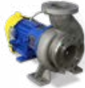
Heavy Duty Process