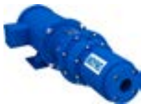
Magnetic Drive Pumps