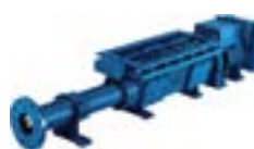
Large Progressing Cavity Pumps