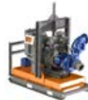
Sewage & Wastewater Pumps