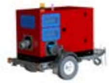
Quiet Solution Pumps