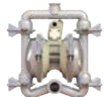
FDA Air Operated Diaphragm Pumps